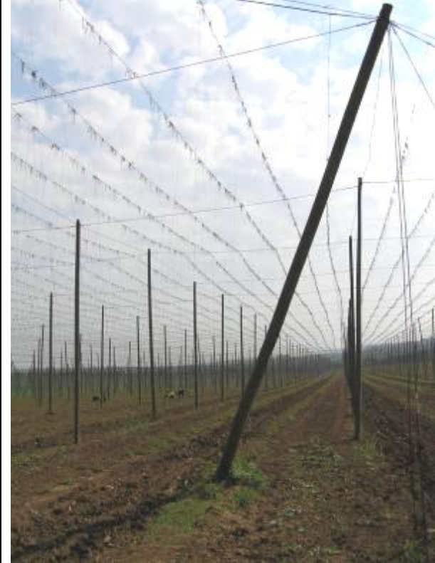
Production village Hrivice (location Woodland)