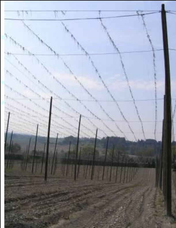
Production village Kroucova (location Woodland)