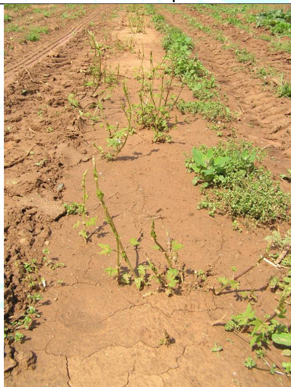
Focus on the plant