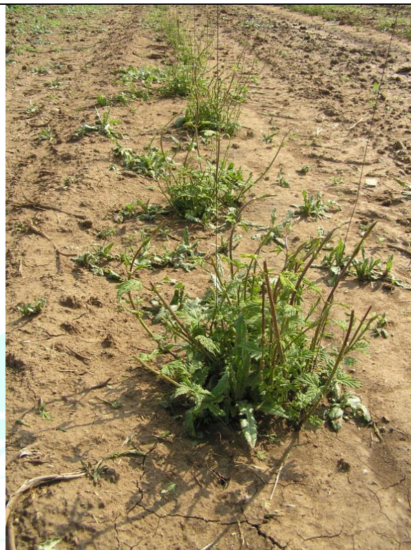
Focus on the plant