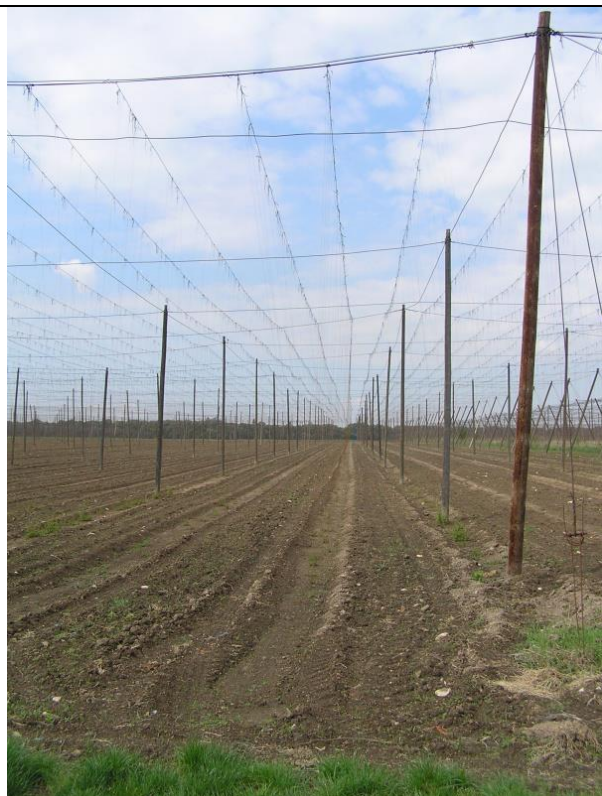
Production village Rocov (location Woodland)