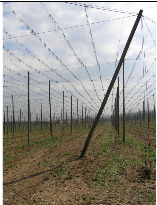
Production village Hrivice (location Woodland)