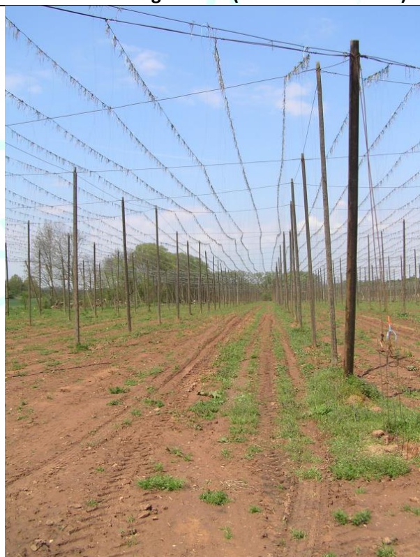
Production village Zelec (location Golden Creek Valley)