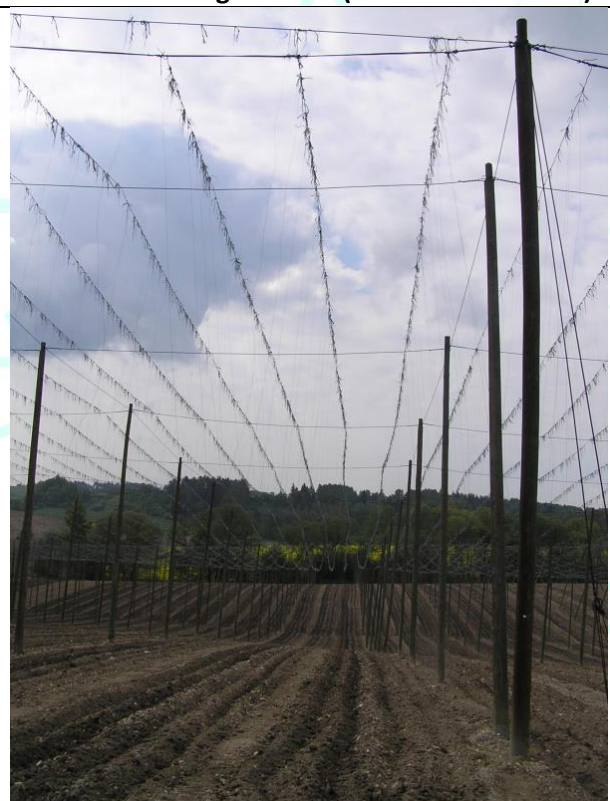
Production village Kroucova