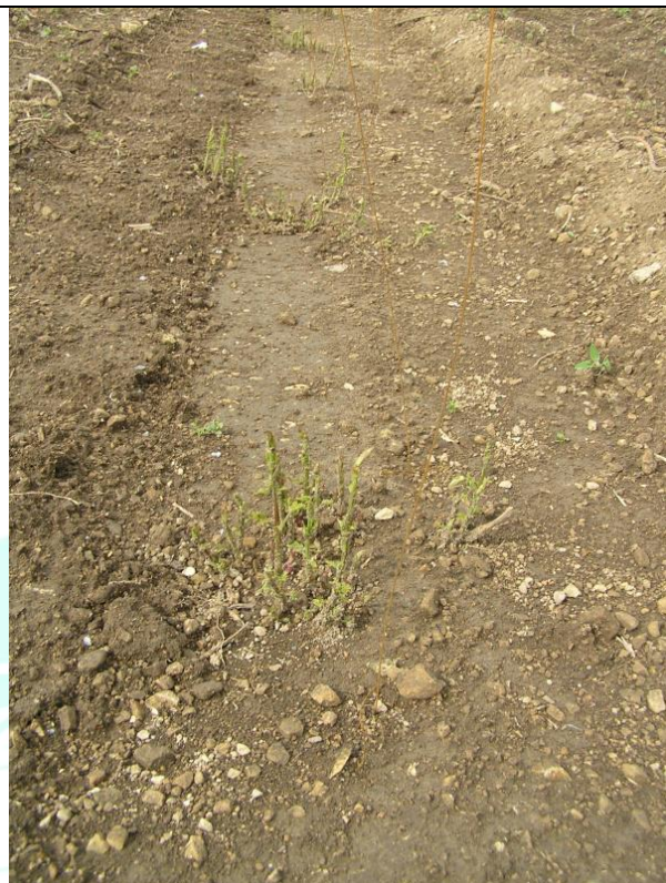
Focus on the plant