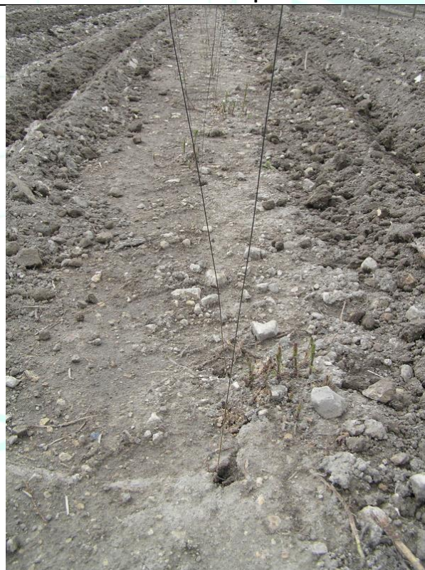
Focus on the plant