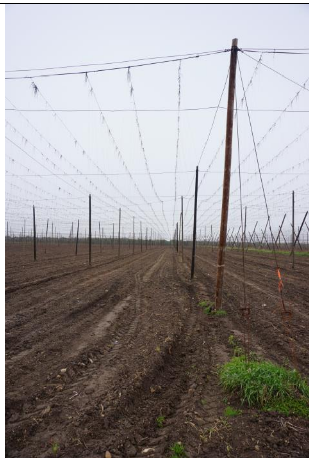
Production village Rocov (location Woodland)