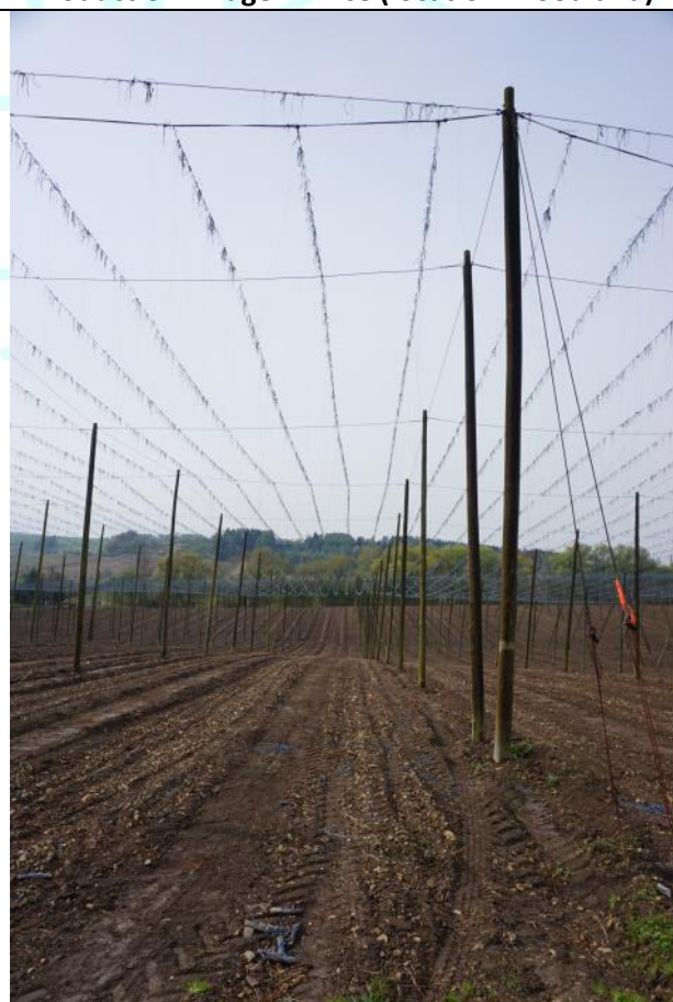
Production village Kroucova