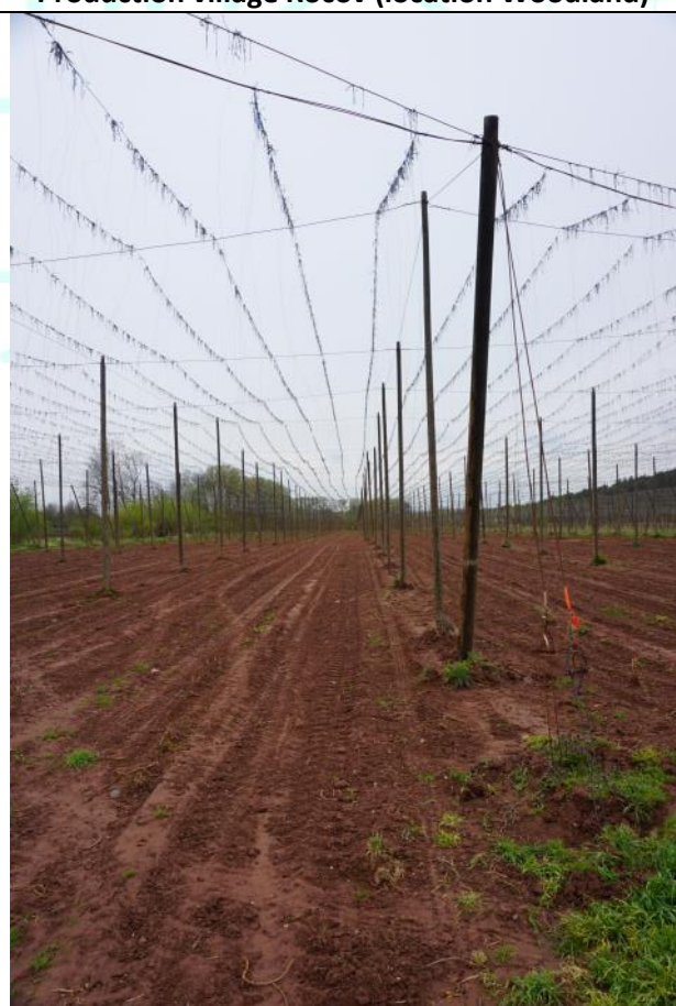
Production village Zelec (location Golden Creek Valley)