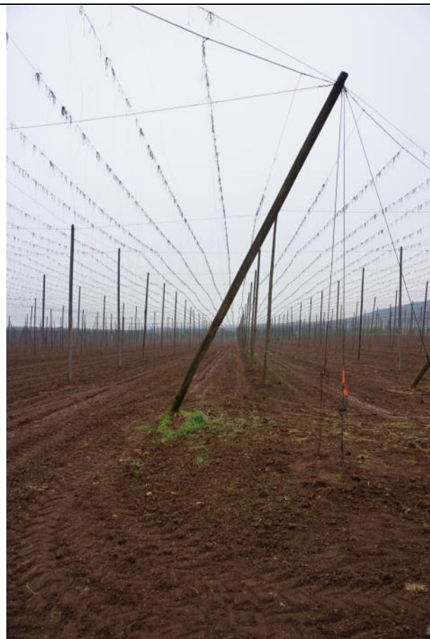
Production village Hrivice (location Woodland)