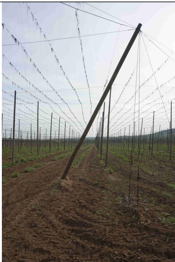
Production village Hrivice (location Woodland)