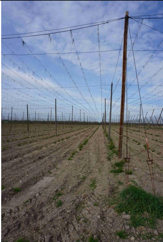
Production village Rocov (location Woodland)