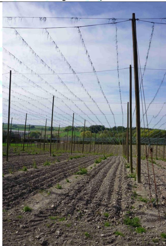
Production village Kroucova