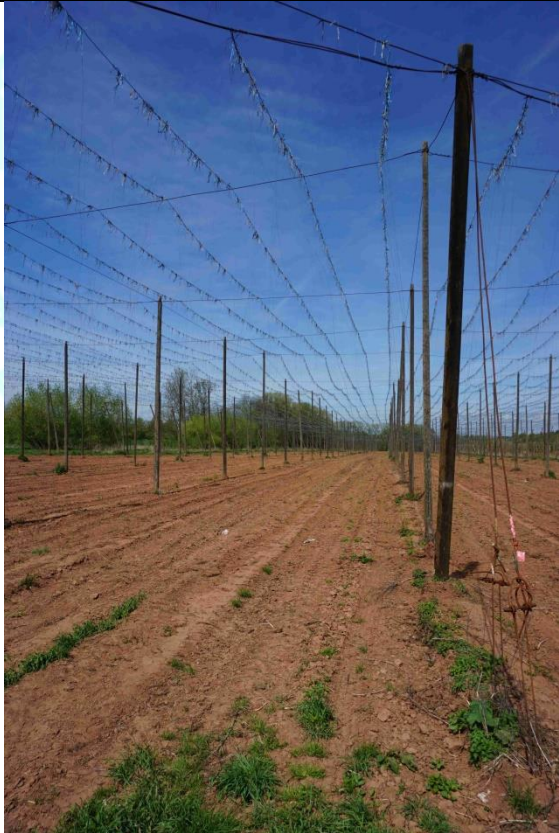
Production village Zelec (location Golden Creek Valley)