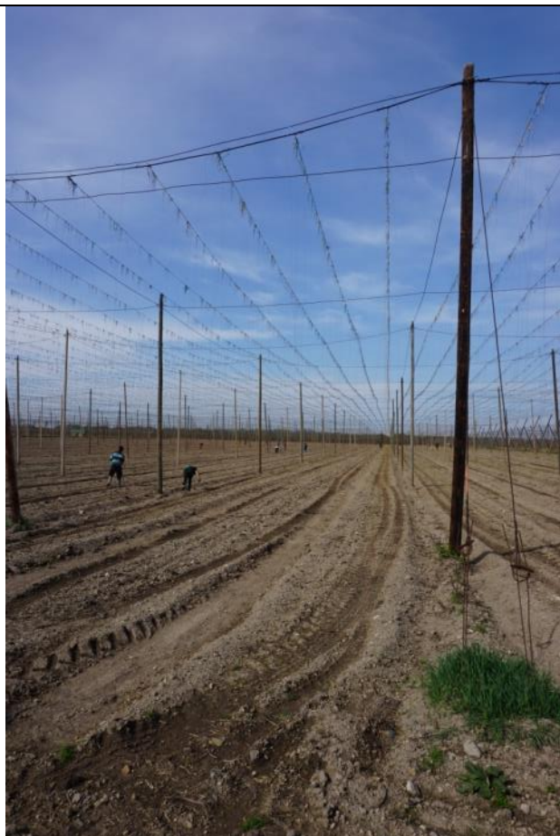
Production village Rocov (location Woodland)