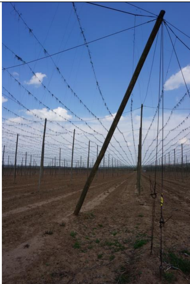
Production village Hrivice (location Woodland)