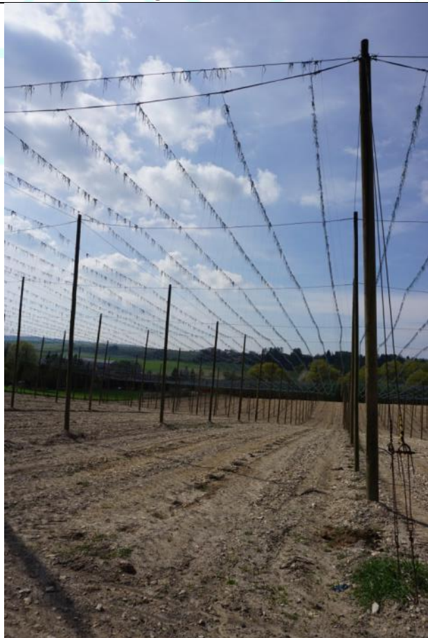
Production village Kroucova