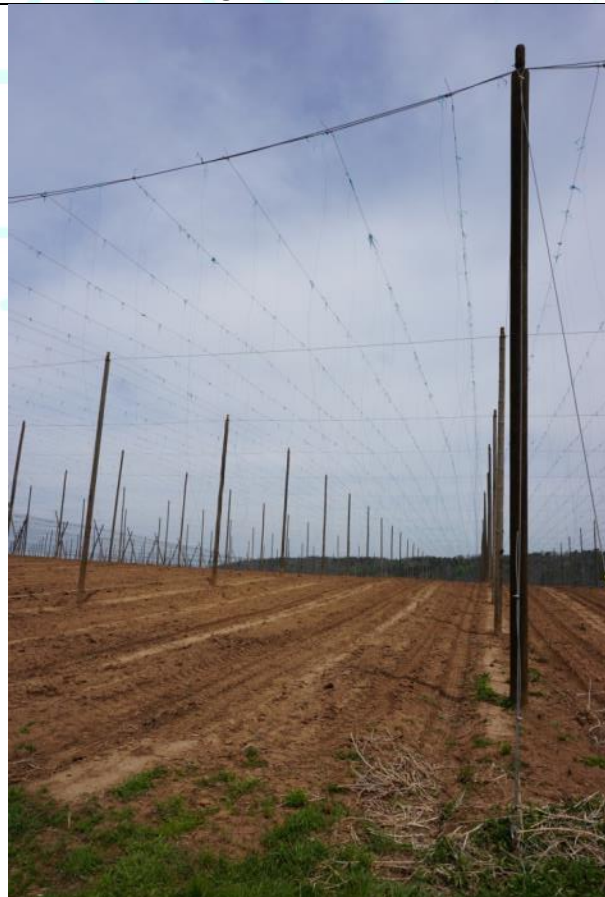
Production village Zelec (location Golden Creek Valley)