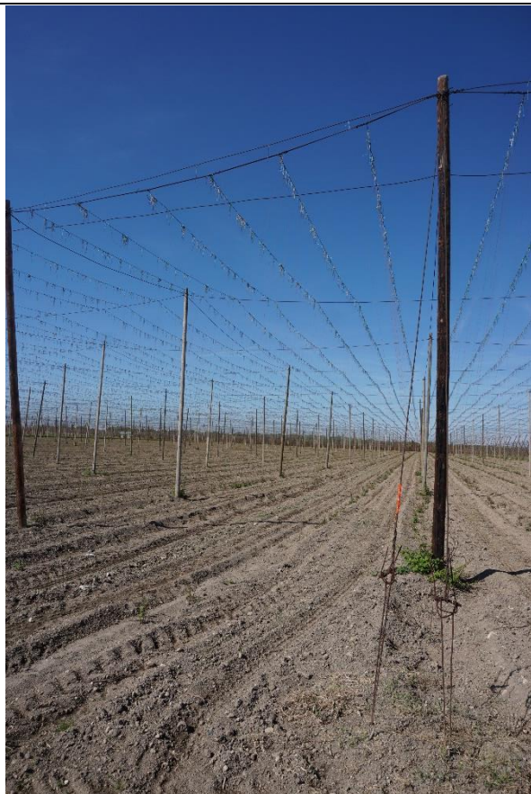
Production village Rocov (location Woodland)