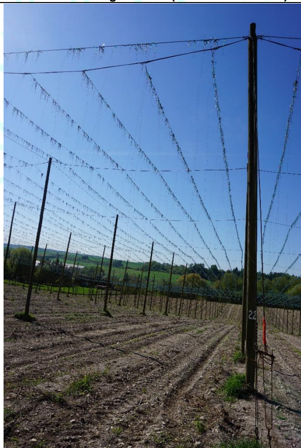
Production village Kroucova