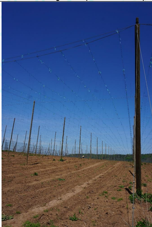
Production village Zelec (location Golden Creek Valley)