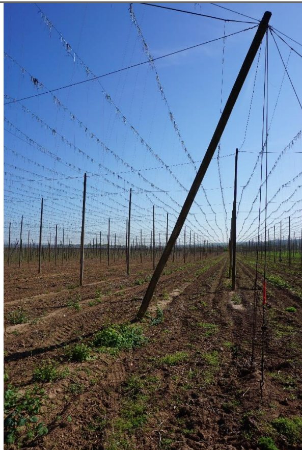
Production village Hrvice (location Woodland)