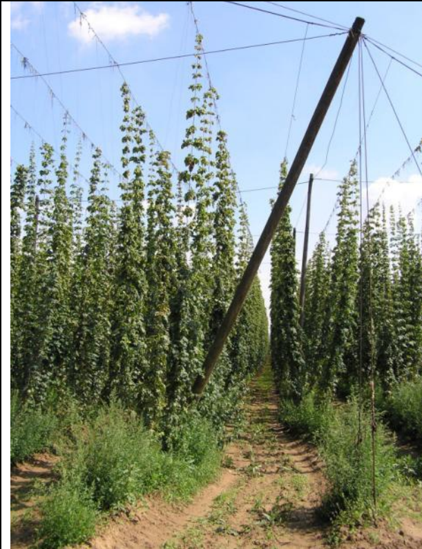
Production village Hrivice (location Woodland)