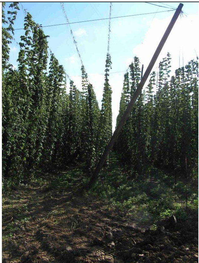
Production village Hrvice (location Woodland)