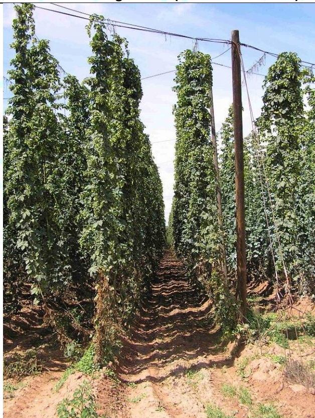
Production village Zelec (location Golden Creek Valley)