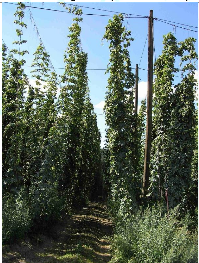
Production village Kroucova