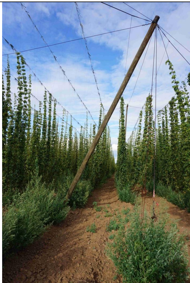
Production village Hrvice (location Woodland)