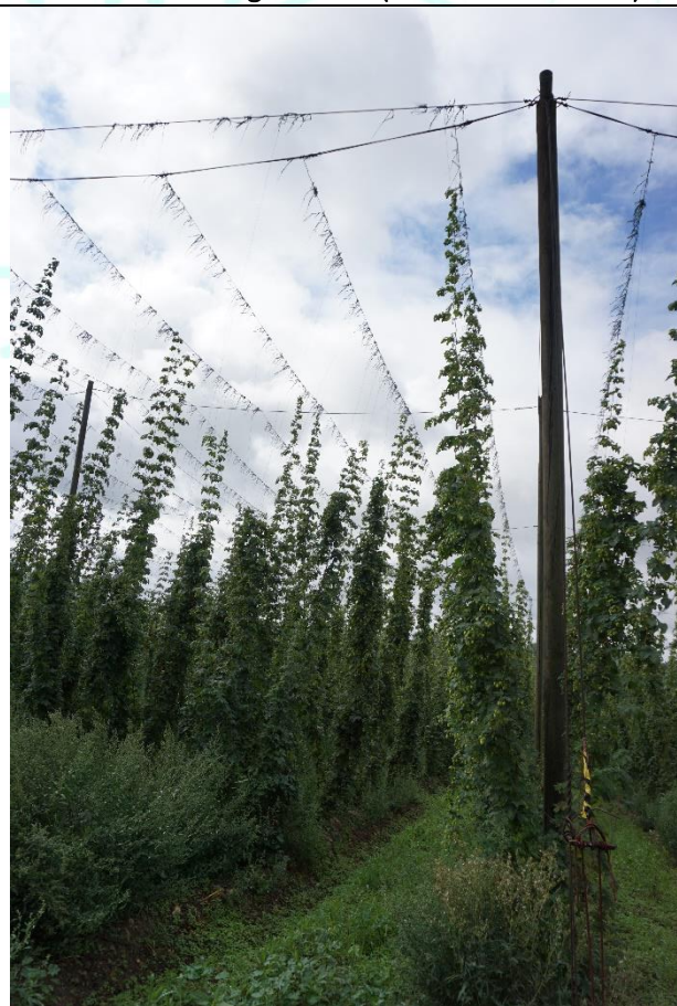
Production village Kroucova (location Woodland)