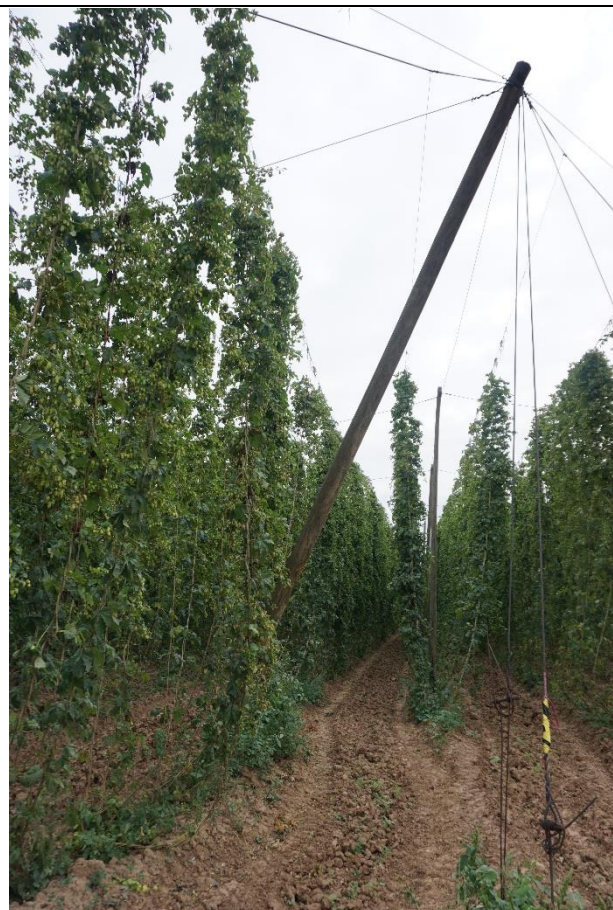
Production village Hrvice (location Woodland)