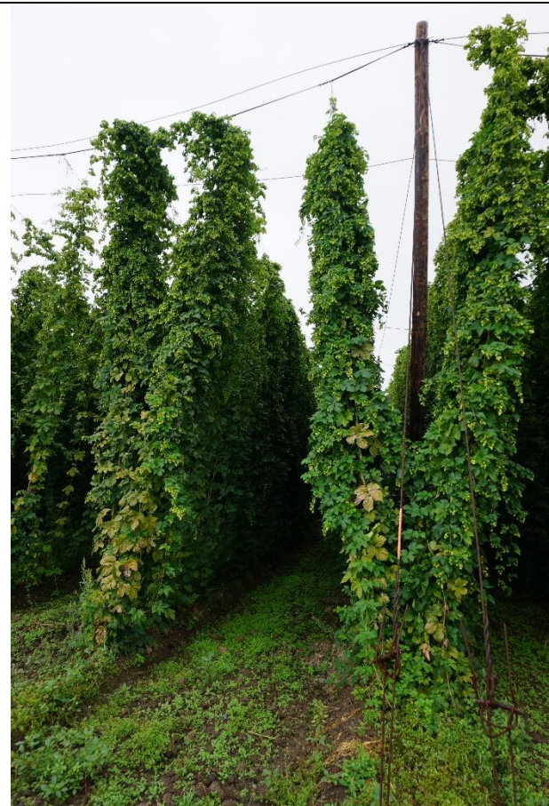
Production village Rocov (location Woodland)