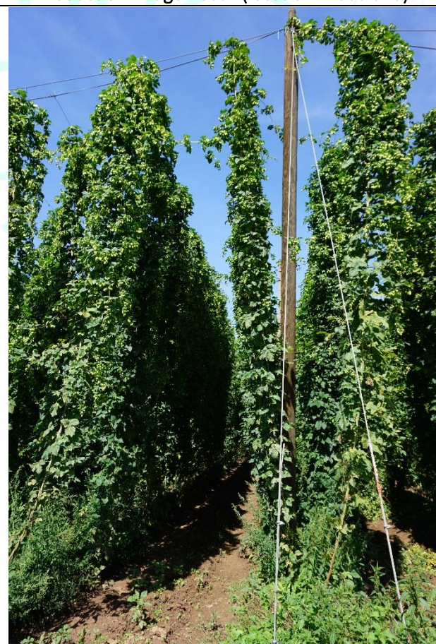
Production village Zelec (location Golden Creek Valley)