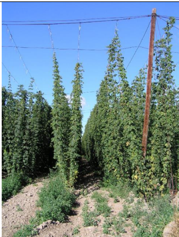
Production village Rocov (location Woodland)