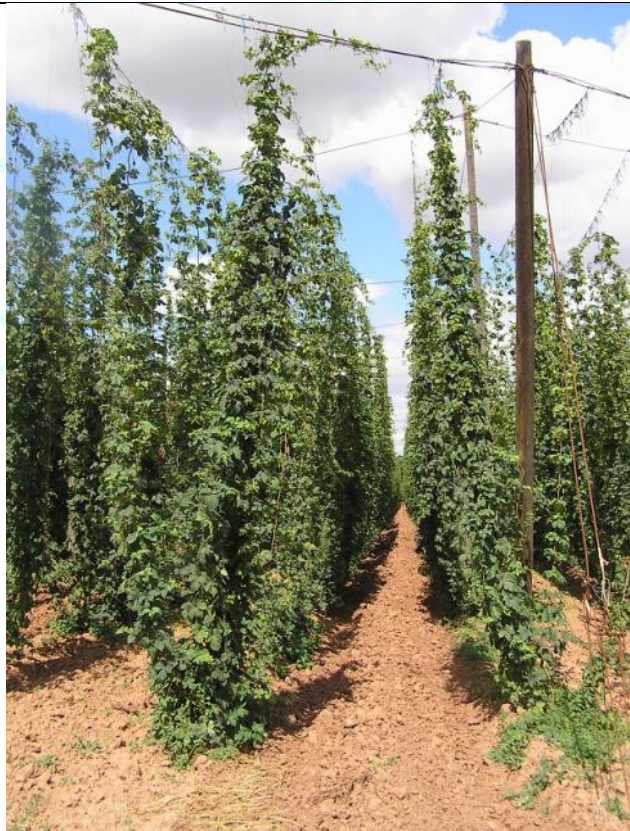
Production village Zelec (location Golden Creek Valley)