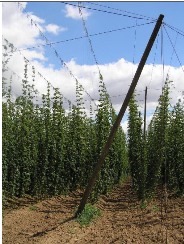
Production village Hrvice (location Woodland)