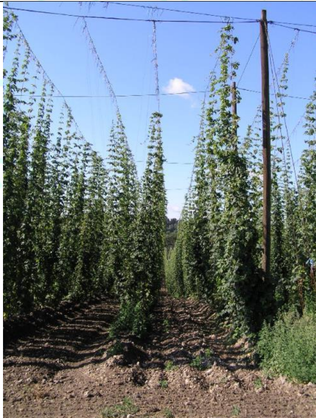
Production village Kroucova