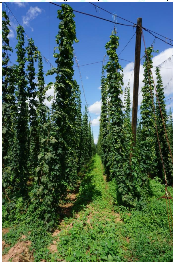
Production village Zelec (location Golden Creek Valley)