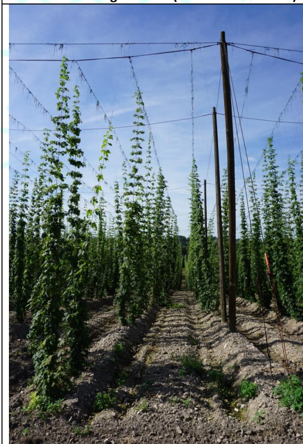
Production village Kroucova