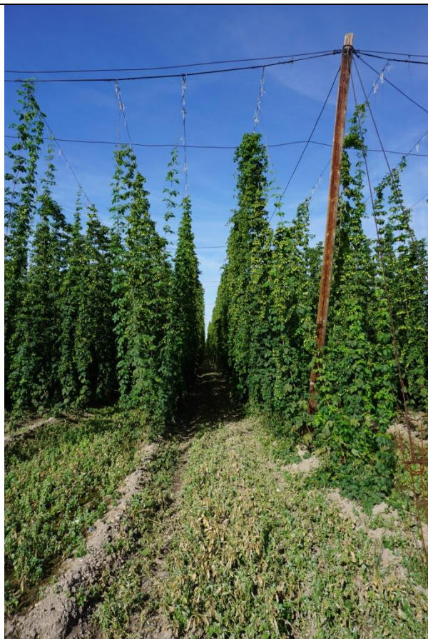
Production village Rocov (location Woodland)