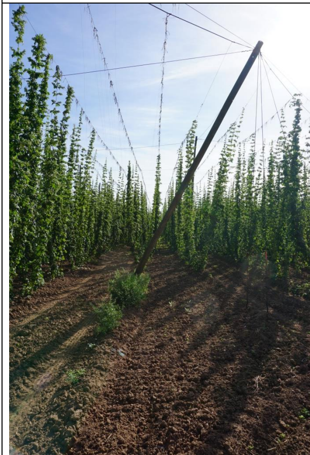
Production village Hrvice (location Woodland)