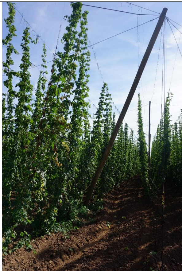
Production village Hrvice (location Woodland)