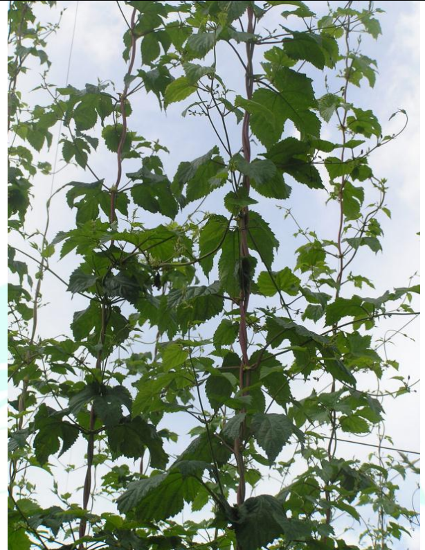
Focus on the plant