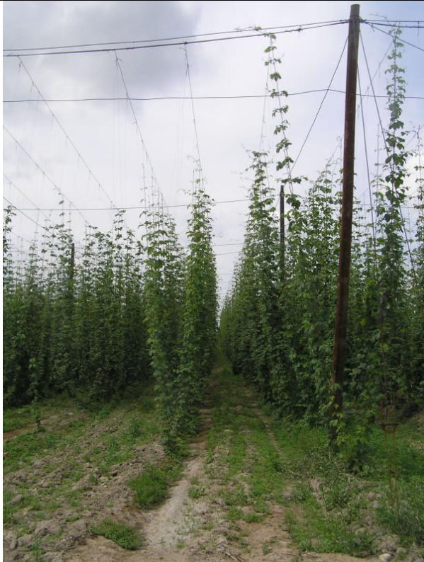
Production village Rocov (location Woodland)