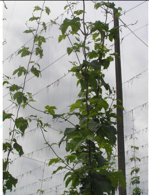
Focus on the plant