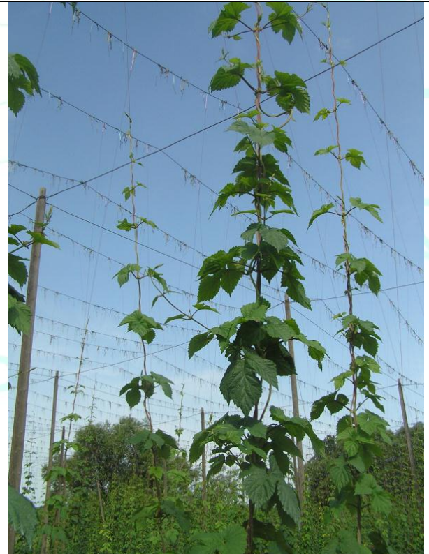
Focus on the plant