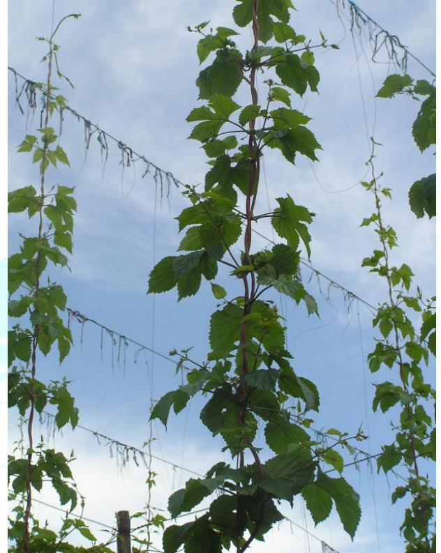
Focus on the plant