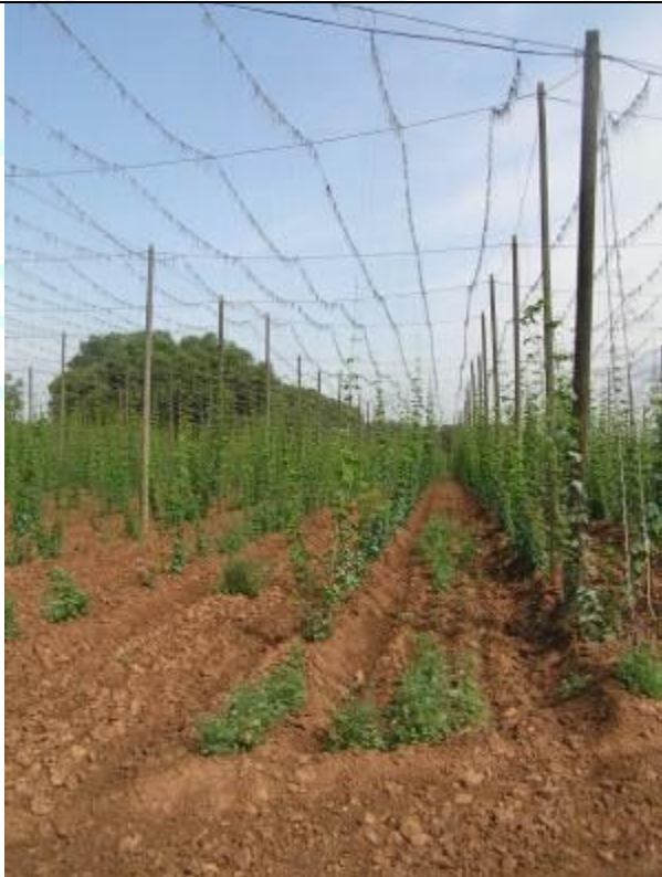
Production village Zelec (location Golden Creek Valley)