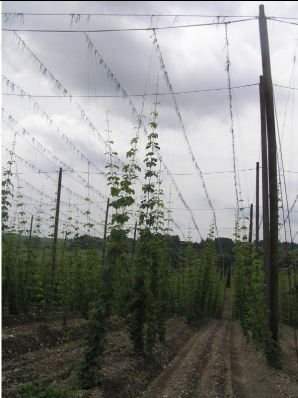
Production village Kroucova