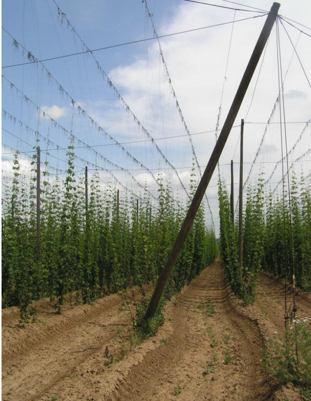
Production village Hrivice (location Woodland)