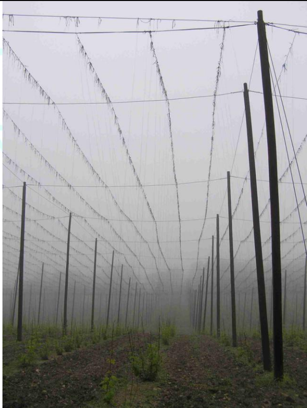
Production village Kroucova