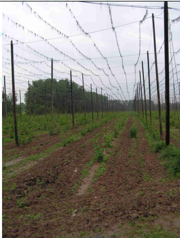
Production village Zelec (location Golden Creek Valley)