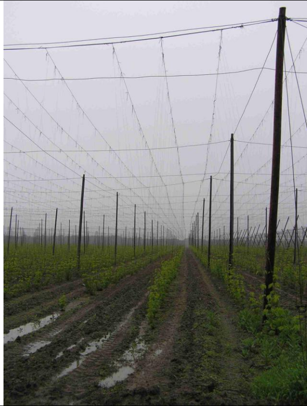
Production village Rocov (location Woodland)