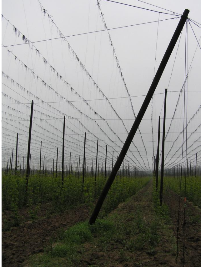
Production village Hrivice (location Woodland)