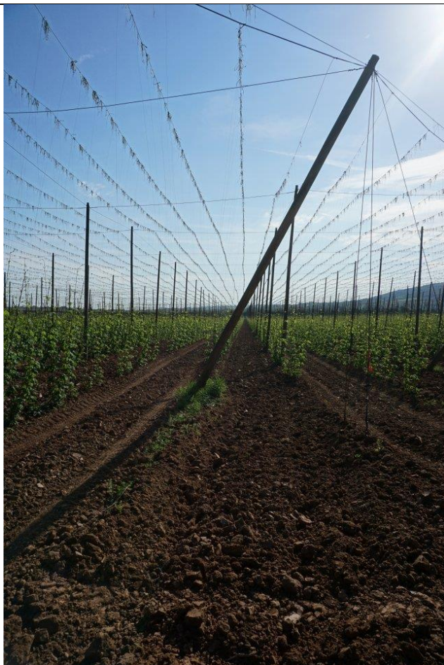
Production village Hrvice (location Woodland)