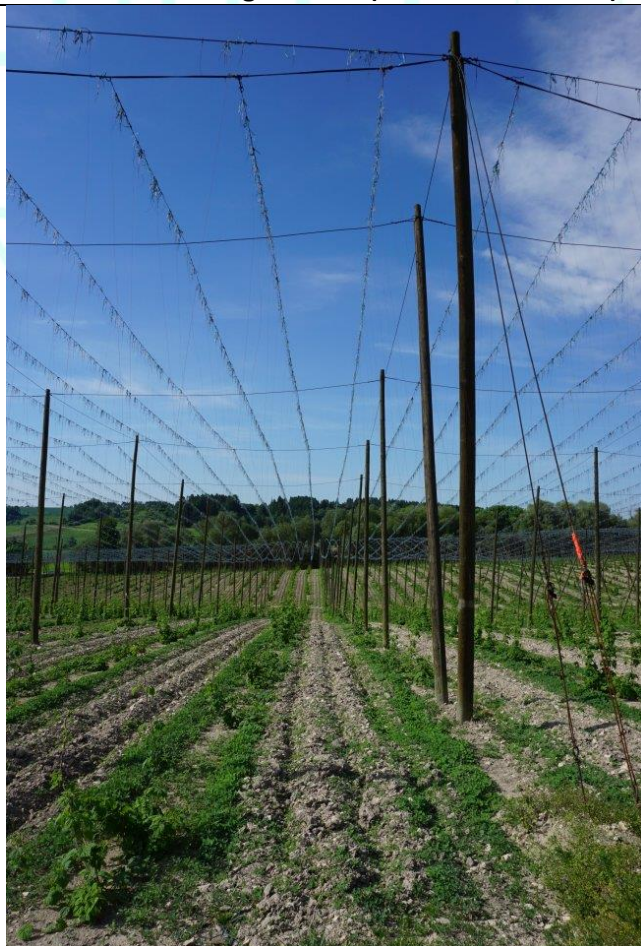
Production village Kroucova