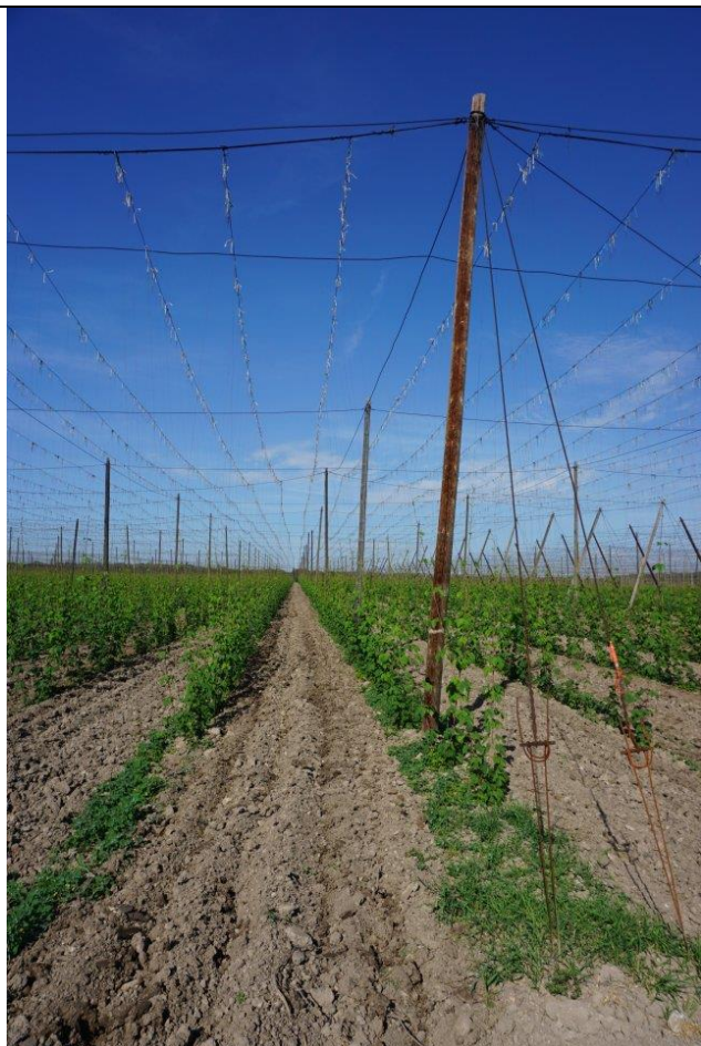
Production village Rocov (location Woodland)