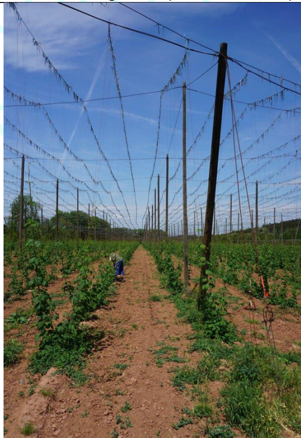
Production village Zelec (location Golden Creek Valley)