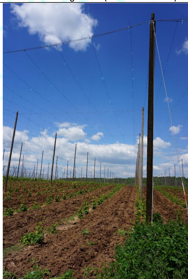
Production village Zelec (location Golden Creek Valley)