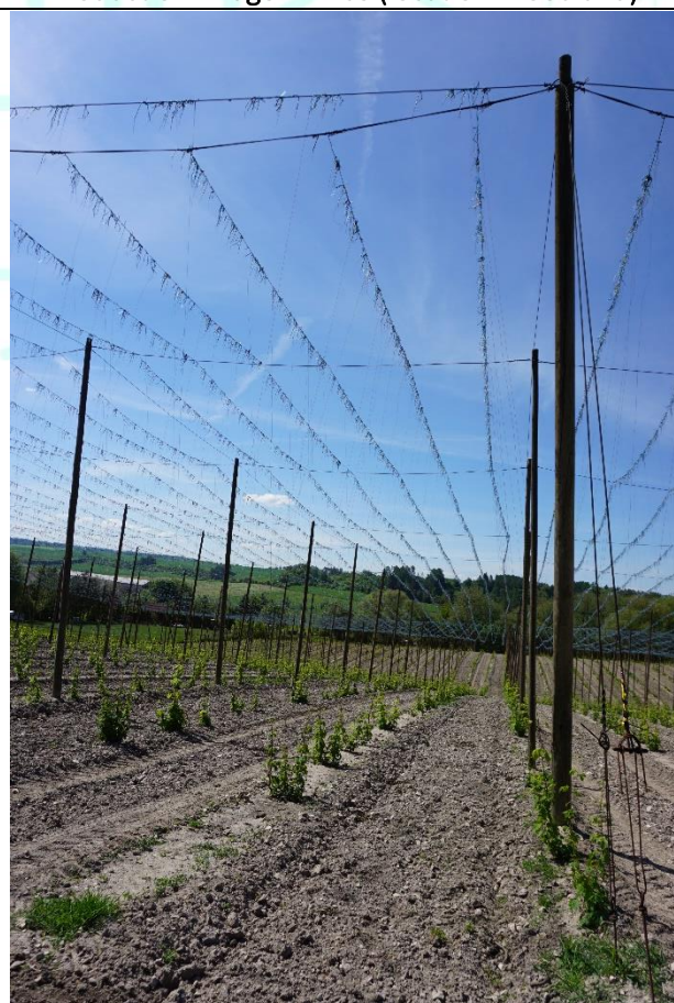
Production village Kroucova (location Woodland)