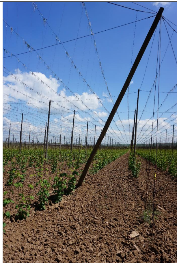
Production village Hrvice (location Woodland)